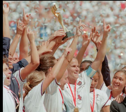
1999 U.S. Women's National Team ("The 99'ers")