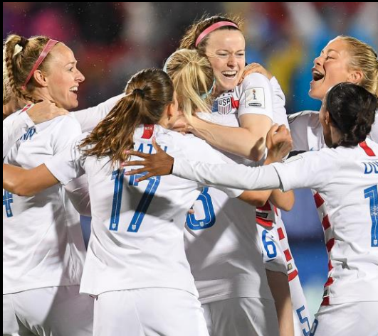
2019 U.S. Women's National Team