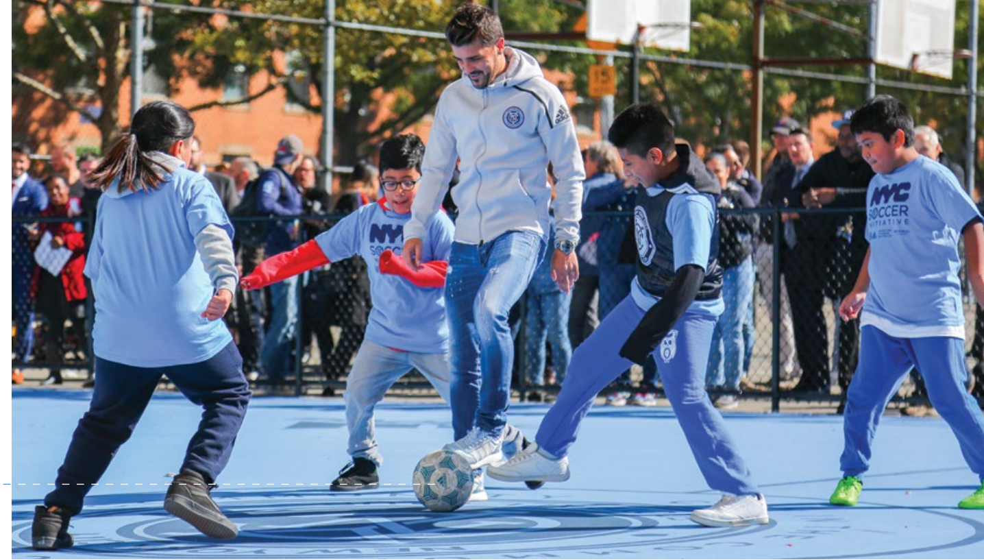
NYCFC captain David Villa scrimmages on a New York City Soccer Initiative mini-pitch with local youth.