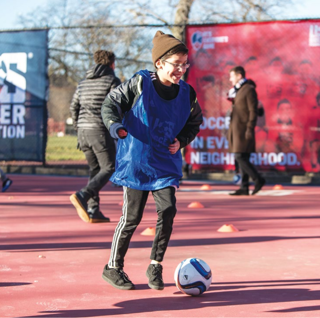
A boy plays at the It's Everyone's Game launch in Chicago.