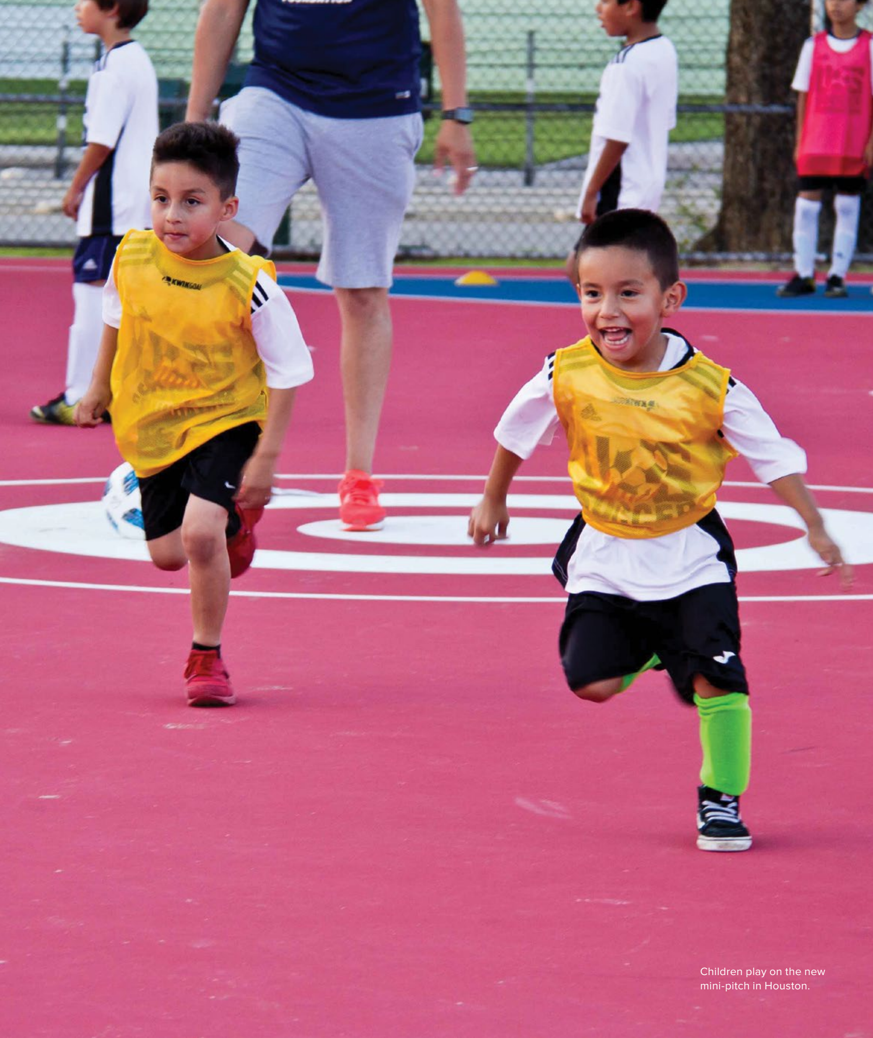
Children play on the new mini-pitch in Houston.

MAY ■ U.S. Soccer Foundation and Target unveil two mini-pitches in Houston, Texas with Houston Parks and Recreation—the first of 100 to be built nationwide. ■ 11 Members of Congress and 16 former professional athletes participate in the 6th annual Congressional Soccer Match benefiting the U.S. Soccer Foundation. ■ The New York Red Bulls, Newark Public Schools, the U.S. Soccer Foundation, and Wells Fargo announce a new initiative to build 20 mini-pitches and engage 2,500 youth in Soccer for Success .