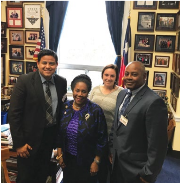
Members of Houston Parks and Recreation Department meet with Representative Sheila Jackson Lee on Capitol Hill Day.