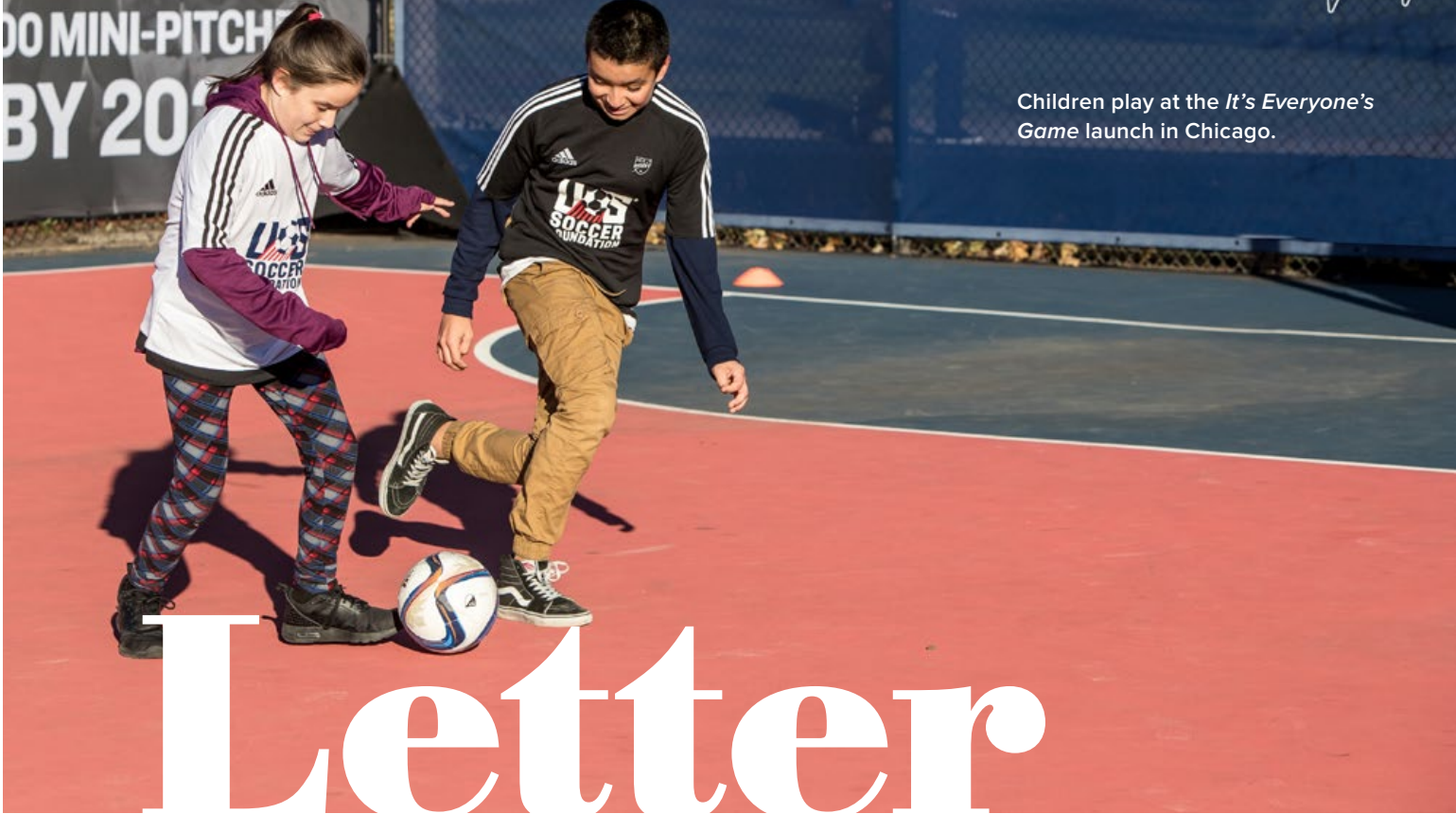
Children play at the It's Everyone's Game launch in Chicago.

[ This report details our 2018 fiscal year. ]