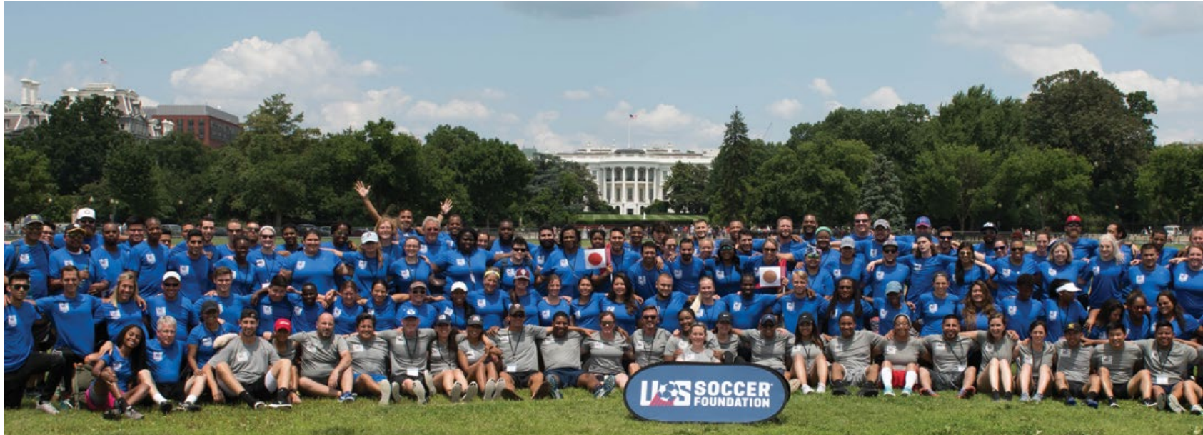
Coach-mentors at National Training in Washington, D.C.