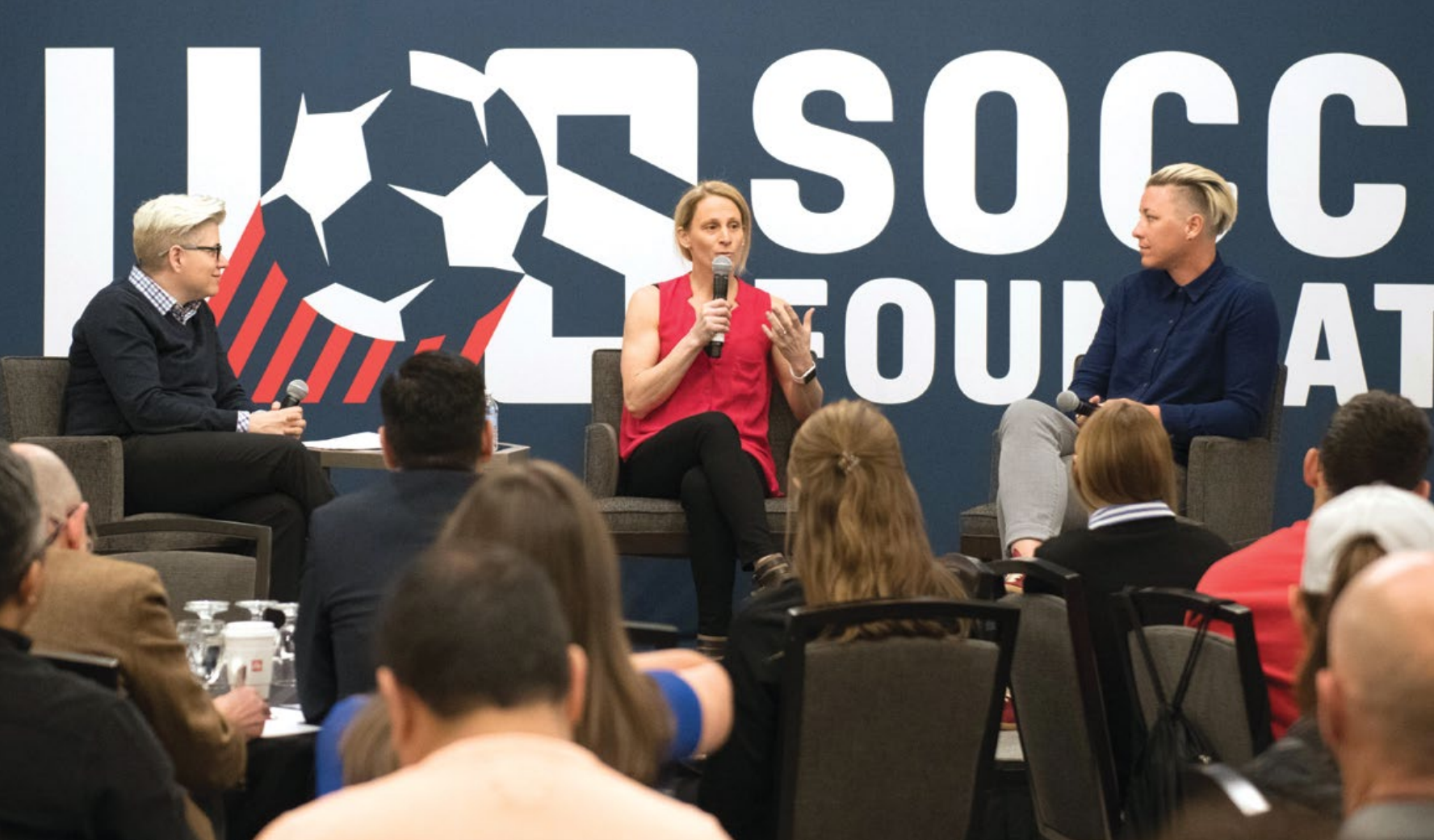
Kristine Lilly and Abby Wambach address attendees at the Urban Soccer Symposium.