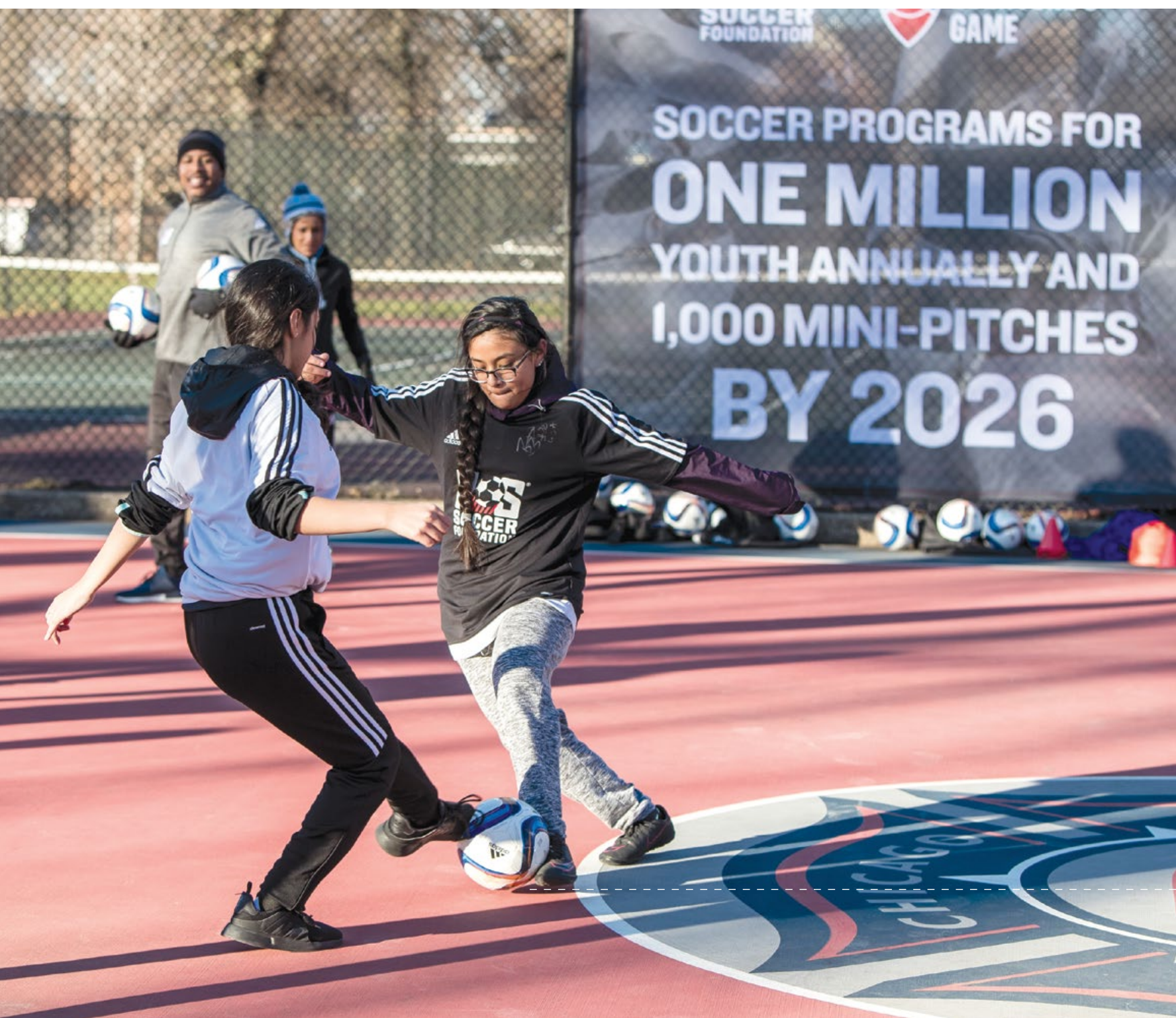
Children play at the It's Everyone's Game launch in Chicago.