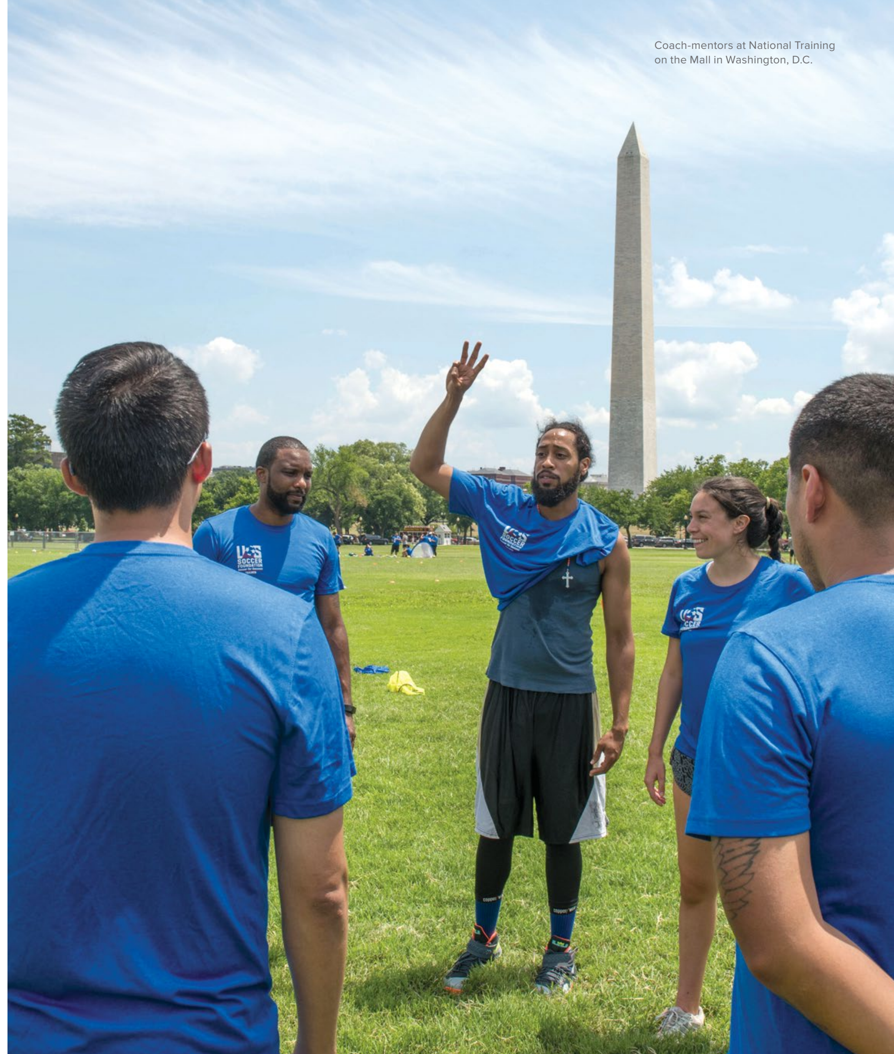
Coach-mentors at National Training on the Mall in Washington, D.C.